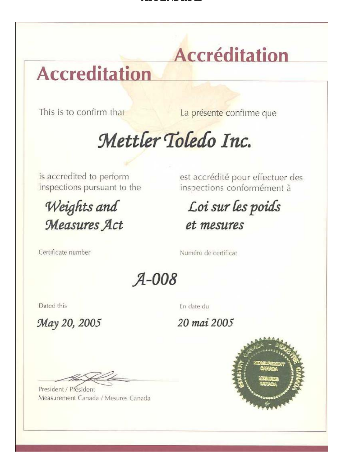
Figure B: Certificate of accreditation for load cell