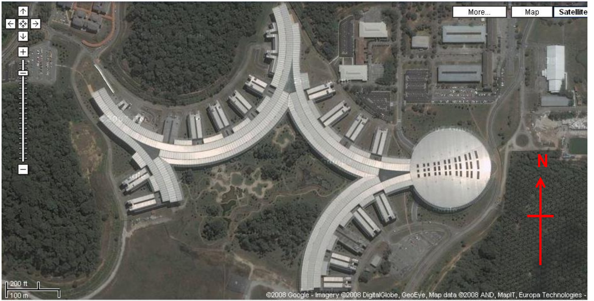
Appendix 2: UTP Map